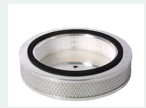
HEPA absolute filter on model T40W