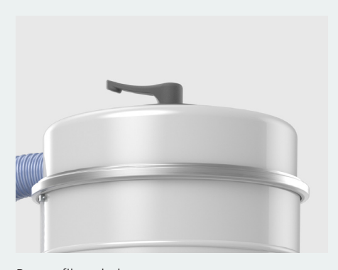
Rotary filter shaker