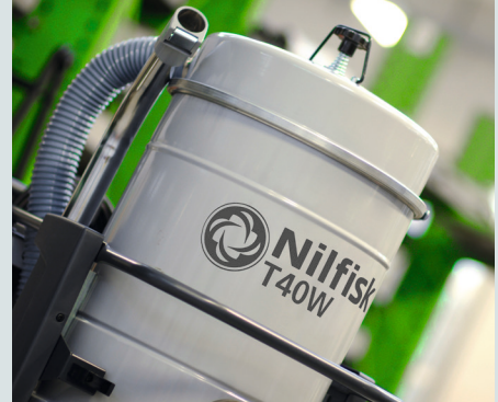
General cleaning Recovery of oil Strong and reliable